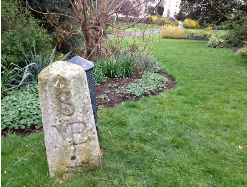
Parish boundary stone of 1821 in Regent's Park