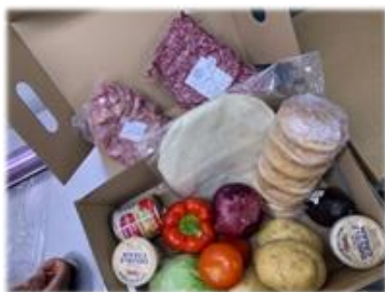
Mystery box of food

Total Number of meals the 50 boxes would serve: 50 \times 6 \times 3 = 900 meals