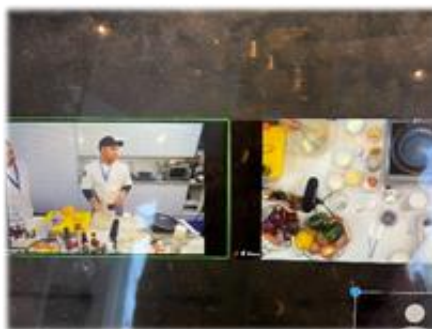
Live Zoom Cooking with Chef