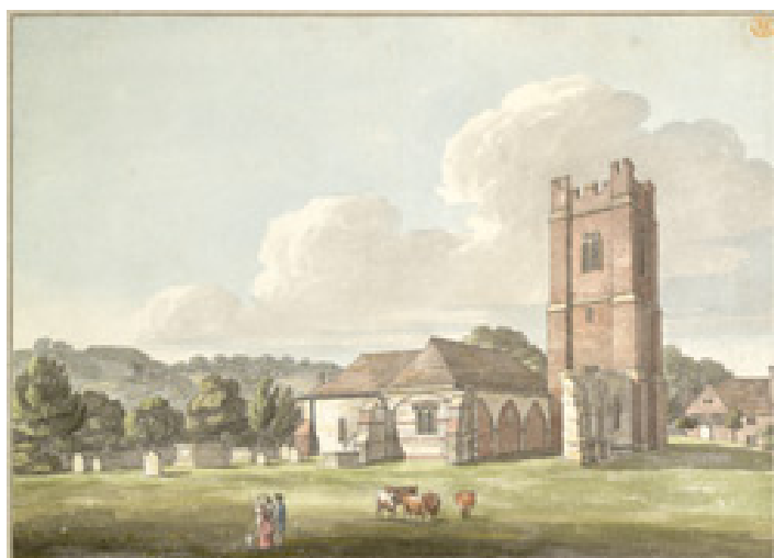
Plumstead Church, Kent, 1775 by Captain Francis Grose F.S.A. (1731 - 1791)